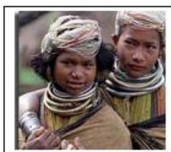
Fig 8: Tribal Ornament