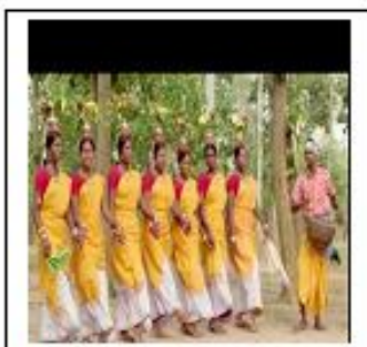
Fig5: Patta Dance & Music