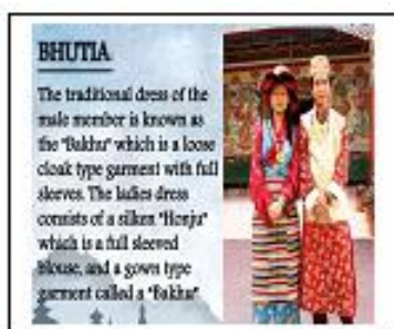
Fig 7: Bhutia Garment

Santal has their own way to adorn themselves with ornaments which is again very distinctive in nature and style. The change in the tribal jewellerys has come along with the evolution of clothing. Some of the ornaments that Santal women wear are 'Hasa-sakam', 'Hasa-mala', 'Methed Sakam', 'Danda jhinhri', 'Danda thumko', and 'Itil Paini' etc.