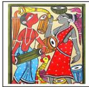
Fig 11: Santali Paintings