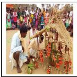
Fig 1: Baha Festival