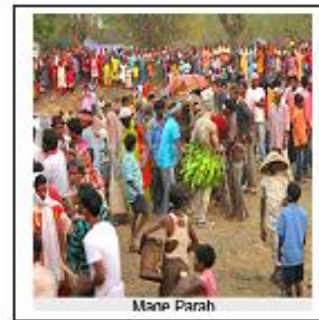
Fig 3: Mage Festival