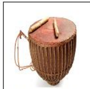
Fig 6: Instrument (Tumdak)