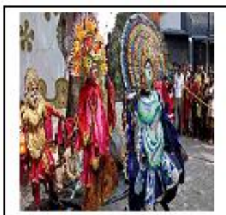
Fig4: Chhau Dance

The multi cultural tribal groups of Eastern India have their own typical instruments that bear their cultural identity. The folk drum remains an essential accompaniment for all sorts of tribal dances. The Santals of West Bengal play the 'Buang', 'Banam', 'Madal' which they call 'Tumdak', or 'Tumdah', a smaller variant of the dhamsha which they call 'Tamdak' and a variety of 'Horns' and 'Flutes' 5 (Tiriao) which are made in Bankura and Birbhum. The drum locally known is 'Timki' is used as the main musical instrument in Karam dance. Ankle bells (Junko) and various kinds of fiddles (Banam) are also used as accompaniment to these musical events of the tribal people. Locals of the Bhutia Basti in the hill district of Darjeeling make a variety of ornate trumpets and a blowing conch and the 'Thanchen', a unique long ceremonial trumpet.