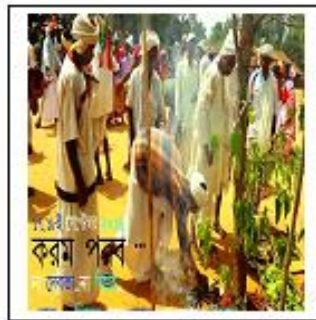
Fig 2: Karam Festival