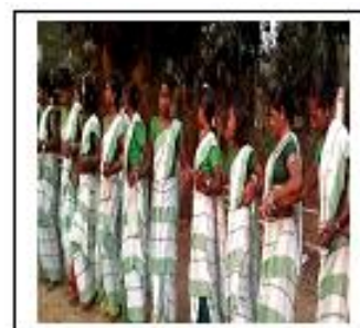
Fig 9: Tribal Garment