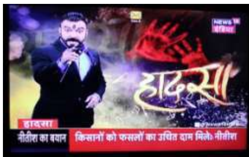
Figure (1.3): Example of dramatic appearance of the anchor in Hindi news channel.

During this study, it was observed that one of the studied Hindi news channels (News 18 India) had dramatic appearance of its anchors for few programmes. Figure (1.3) gives an example of such dramatic appearance of the anchor in Hindi news channel.