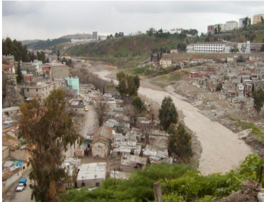
Figure 2. The slum of Bardo before its eradication