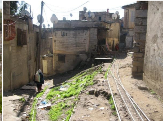
Figure 3. Interior view of the neighborhood.